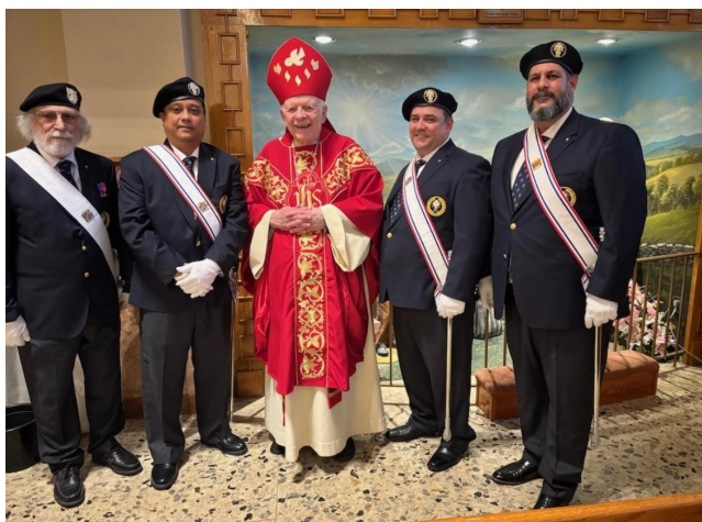
Looks like there was a Confirmation in Lyndhurst!