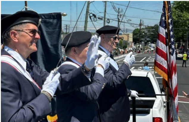
Sir Knights render a salute to the veterans as they pass the reviewing stand in Secaucus.