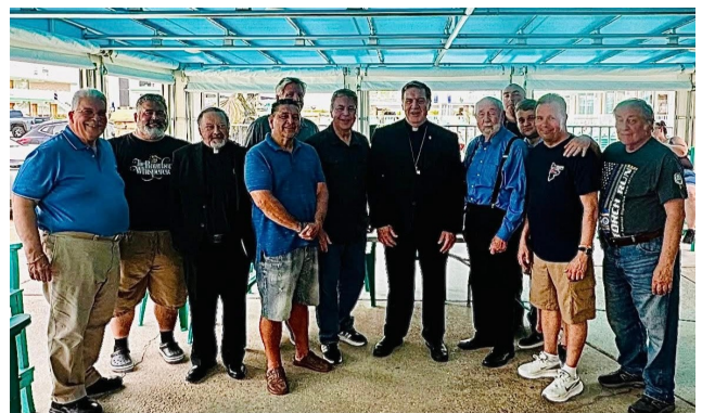
Cardinal Tobin surrounded by the Hudson County Delegation!

The Knights and the North Arlington Veterans will hold their Annual Flag Retirement Ceremony at the Columbian Club Hall, 194 River Road, North Arlington on Wednesday June 11 at 6:00pm. A light reception will follow afterwards.