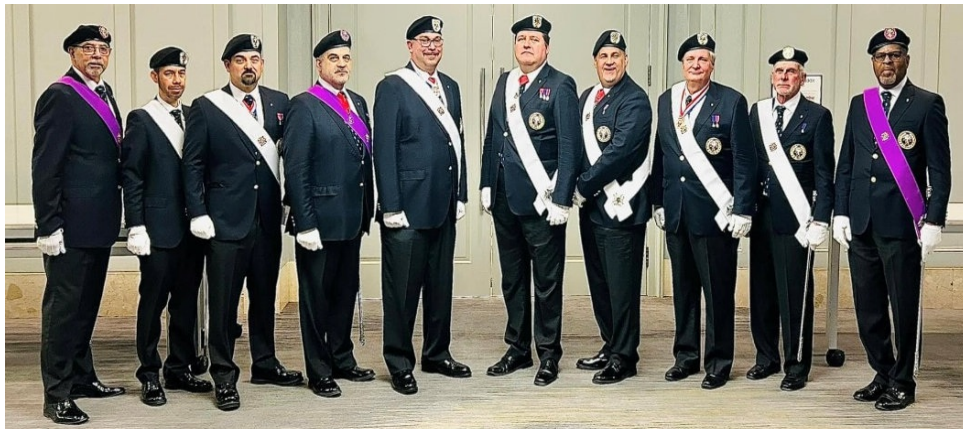
Our District Color Line!