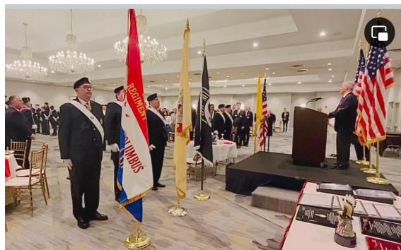
Posting the Colors at the Exemplification Banquet