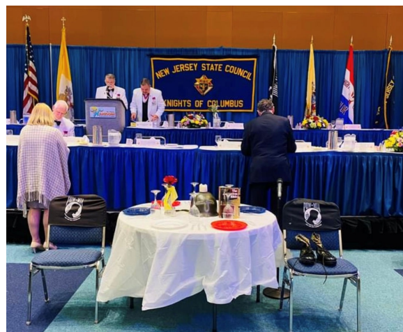
The Missing Man Table at the State Banquet